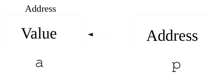
Figure 3 The pointer p points to the variable a.

To access a value to which a pointer points, the \star operator is used. Another operator, the -> operator is used in conjunction with pointers to structures. Here's a short example.